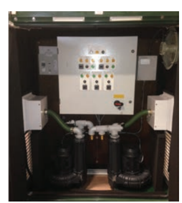
This image is for illustrative purposes only, actual product may vary.

The electrical control panel provides all the required electrical equipment for the starting, running and monitoring of the plant. The control panel can be adapted to accommodate other mechanical and electrical devices associated with the plant, for example a final effluent pump station or UV disinfection.