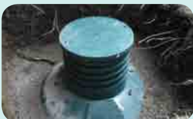
Turret invert extension during installation

The Diamond range offers one of the widest choices for invert extensions giving complete flexibility for different site conditions and installation requirements and allows alignment to existing pipework.