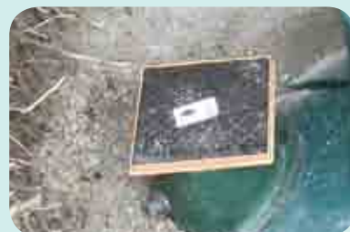
IPC access lid during installation