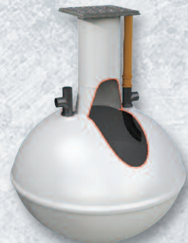
ALPHA SEPTIC TANK