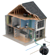
INTEGRATED RAINWATER HARVESTING SYSTEMS