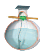
GARDEN WATERING SYSTEMS