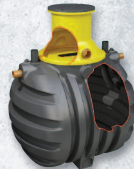
BETA+ SEPTIC TANK