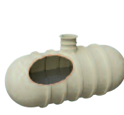
BELOW GROUND STORAGE TANKS