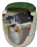
BIODISC® DOMESTIC SEWAGE TREATMENT PLANTS